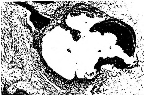
FIG. 2. Horizontal section of the maxilla passing through a fractured root of a mid-molar. The distribution of epithelium around the area occupied by the fractured root is demonstrated. H. and E.

The dislocated root fragments and the adjacent part of the remaining fractured root often showed signs of resorption.