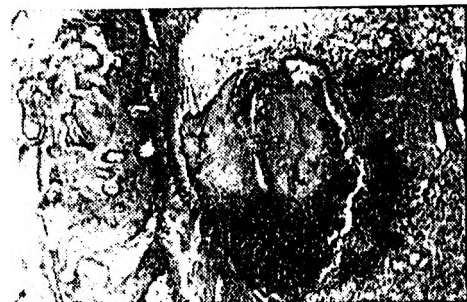
FIG. 4. Horizontal section of the maxilla passing through the apex of a root of a fractured mid-molar. This section shows a downgrowth of epithelium extending up to the apex of the root. H. and E.

The most striking feature in the specimens with fractured roots was the downgrowth of epithelium adjacent to the roots of the affected mid-molar. This epithelium was continuous with the crevicular epithelium and extended towards and up to the apices (Fig. 4). It usually was seen adjacent to the cemental surfaces (Fig. 1), and less frequently lining cavities containing root fragments (Fig. 2).