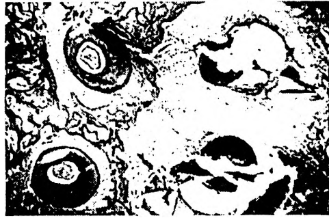
FIG. 3.—Horizontal section passing through the roots of the maxillary molars. The undamaged roots seen on this section are the distal roots of the first molar. The fractured roots are the mesial roots of the mid-molar. The enlarged periodontal spaces, the disorganized fibrous elements and downgrowth of epithelium round the fractured roots is evident. H. and E.

The periodontal spaces around the fractured roots were enlarged; and the fibrous elements, compared with the unaffected teeth, were less dense and disorganized (Fig. 3).