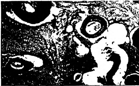
FIG. 5.—Horizontal section of the maxilla passing through the roots of a fractured mid-molar. This section shows the down-growth of epithelium on the inner surfaces of its two unfractured roots. H. and E.

The epithelial down-growths may be seen in relation to all the roots of affected teeth, but it does not encircle all of these roots completely. That associated with the unfractured roots of the affected teeth is more frequently confined to the inner root surfaces (Fig. 5). In this epithelium there was evidence of keratinization in only one of the specimens examined.